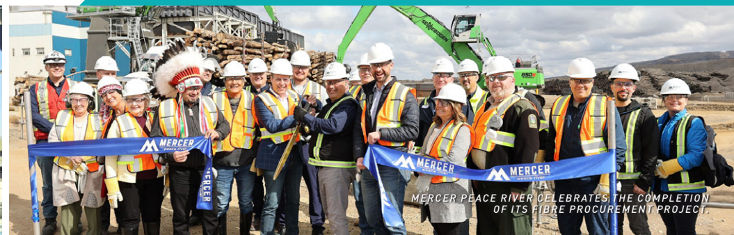
MERCER PEACE RIVER CELEBRATES THE COMPLETION OF ITS FIBRE PROCUREMENT PROJECT.