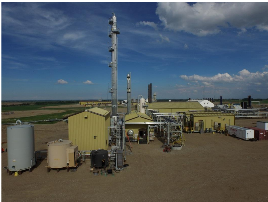
Figure 2: CO 2 Capture Plant at Lashburn

A picture of the plant (as installed) is shown below: