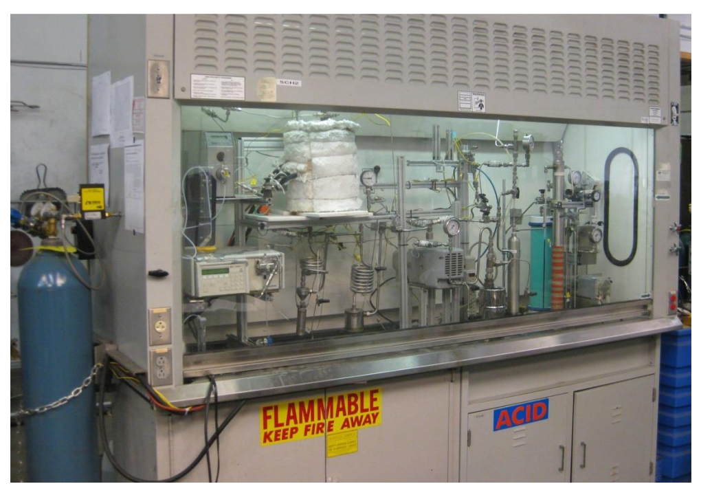
Phase A ketene/diketene production apparatus.