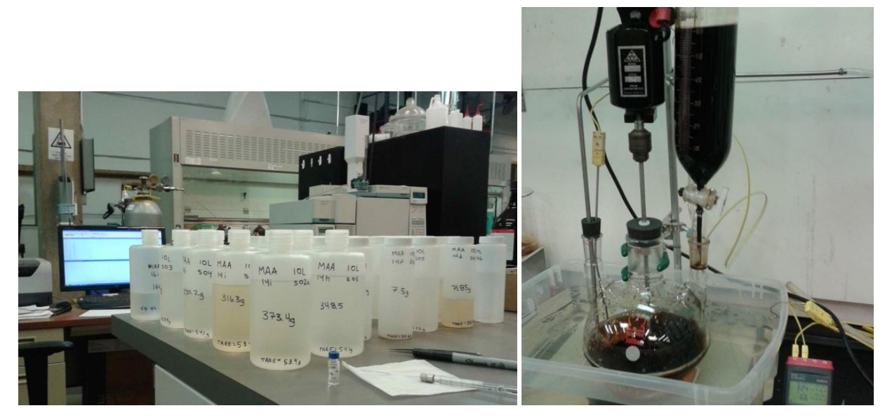
Product samples from hydrogenation experiments (left) and MAA synthesis from diketene (right).

The hydrogenation step to form butanol has been demonstrated in the laboratory at 10L/day using conditions that employ moderate temperature and pressures using inexpensive commercial copper based catalyst that would have excellent longevity and economic value for the process.