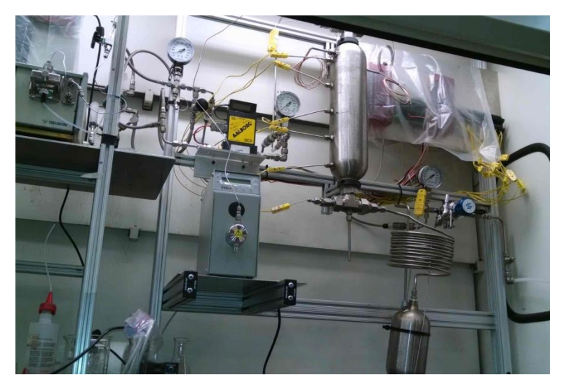
Final Phase B hydrogenation reactor system.

The Phase B reactor system was designed for scale up to 10 L/day butanol with inclusion of a catalyst bed containing a cooling system to control the temperature rise due to exothermic nature of hydrogenation. Running the hydrogenation system at the full 10L/day yielded excellent results corresponding to those observed on smaller scale.